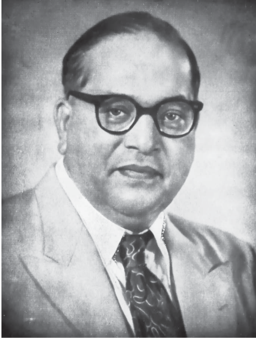
Babasaheb Dr. B.R. Ambedkar (14th April 1891 - 6th December 1956)