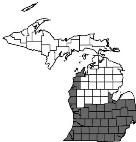
Figure 1. Indiana bat range in Michigan

Indiana bats have been documented at many sites in lower Michigan and are believed to range throughout the southern five county tiers, as well as parts of the thumb and the western coastal counties up to (and including) the Leelanau Peninsula (see Figure 1 below). Michigan is home to a single known Indiana bat hibernaculum: a hydroelectric dam in Manistee County (Tippy Dam). Although the dam supports about 20,000 hibernating bats, Indiana bats comprise less than 1% of the winter population. Research suggests that the majority of the Indiana bats that summer in Michigan migrate to hibernacula in adjacent states, such as Indiana, Ohio, and Kentucky.